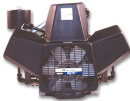
Technical Specifications for Lubricated Reciprocating Compressors.