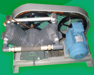
Air Cooled Lubricated Vacuum Pump from ANEST IWATA MOTHERSON LTD.